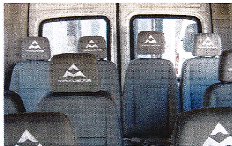
14 people can sit comfortably in the Maxus.

are currently 10 dealers nationwide to provide sales and service.