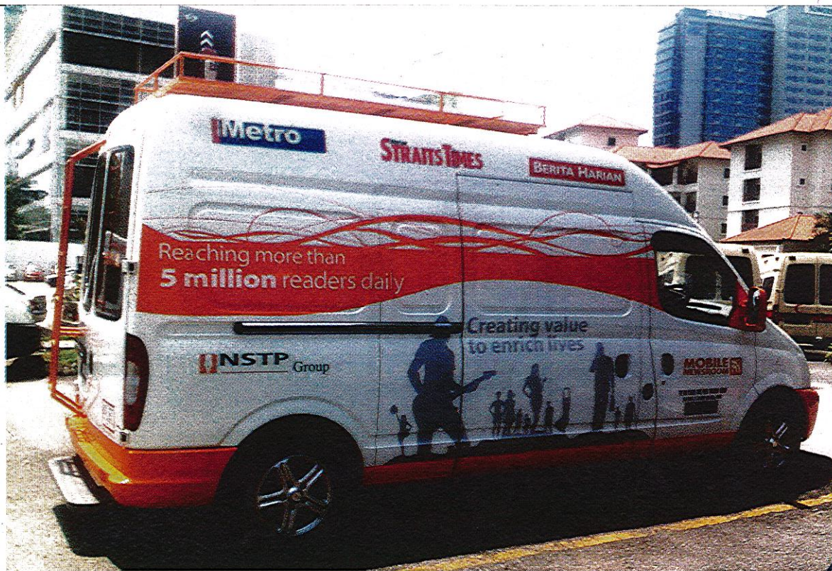
The New Straits Times' mobile newsroom is a Maxus.