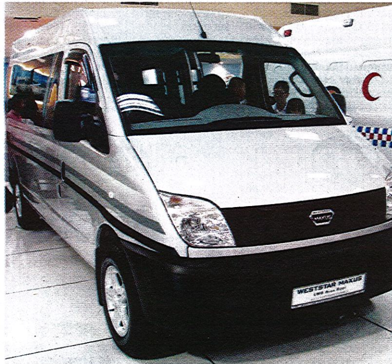
The Maxus V80 comes with a three-year warranty.

The van can carry up to 15 passengers. The V80 flagship showroom and service centre is in Jalan Tun Razak, Kuala Lumpur. There is a branch in Johor Baru and Weststar is planning to open another in Alor Star. There are currently 10 dealers nationwide to provide sales and service.