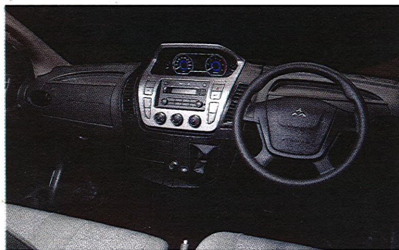
Cabin layout is simple, with buttons and levers placed ergonomically.